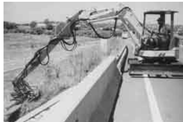
A Weedbug working on the roadside