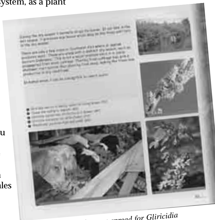
Sample from a double-page spread for Gliricidia

Strongly recommended – especially for anyone interested in species and cultivars for S.E. Asia