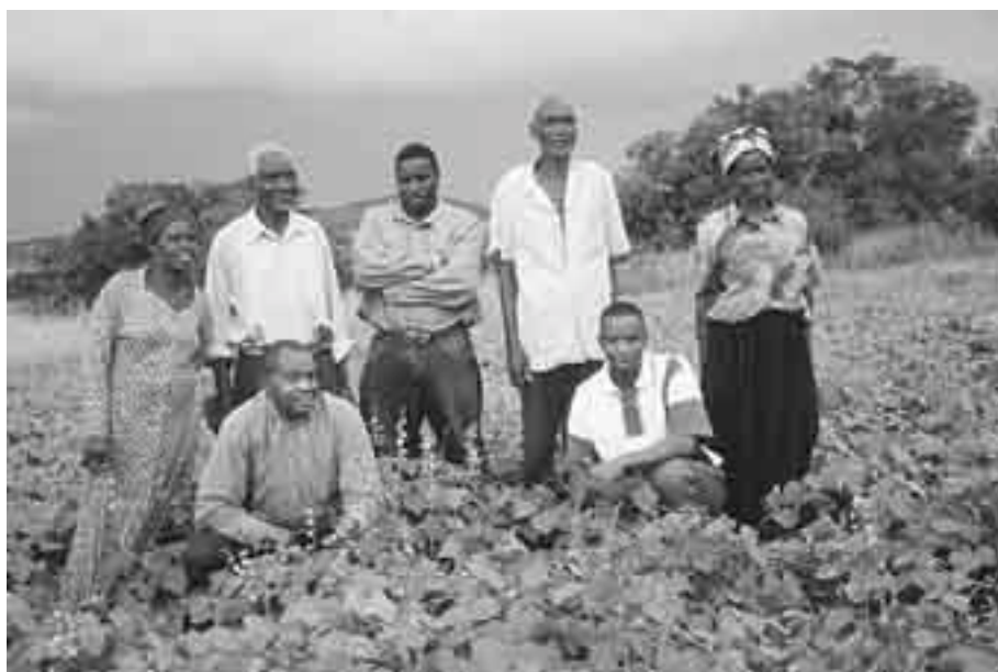
Local farmers and extension officers pose in a good crop of Highworth lablab.

extend their plantings or to sell to neighbours. The use of lablab to fix nitrogen in a ley farming system is being investigated. After a long history of growing maize, soil nitrogen and organic matter has been severely depleted in these inherently infertile soils.